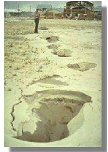
a) Some effects of liquefaction during the 1964 Niigata earthquake b) Sand Boil conditions